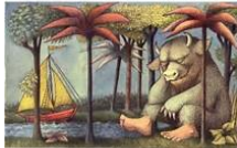
WHERE THE WILD THINGS ARE

We will read two texts – ‘Where the Wild Things Are’ and ‘The Three Little Pigs’. We will be immersing ourselves in the stories through drama, role-play, story maps and character descriptions.